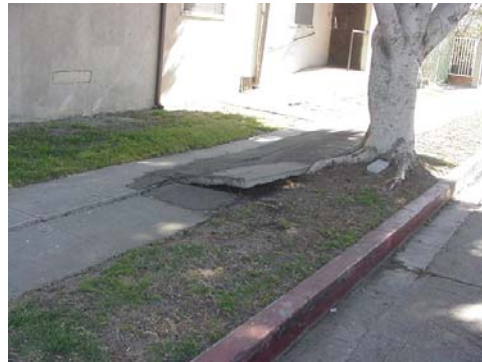
This photo illustrates severe trip hazards due to the uneven walking surface caused by the tree roots. In this case, the tree should be removed and the damaged section of the sidewalk should be replaced.