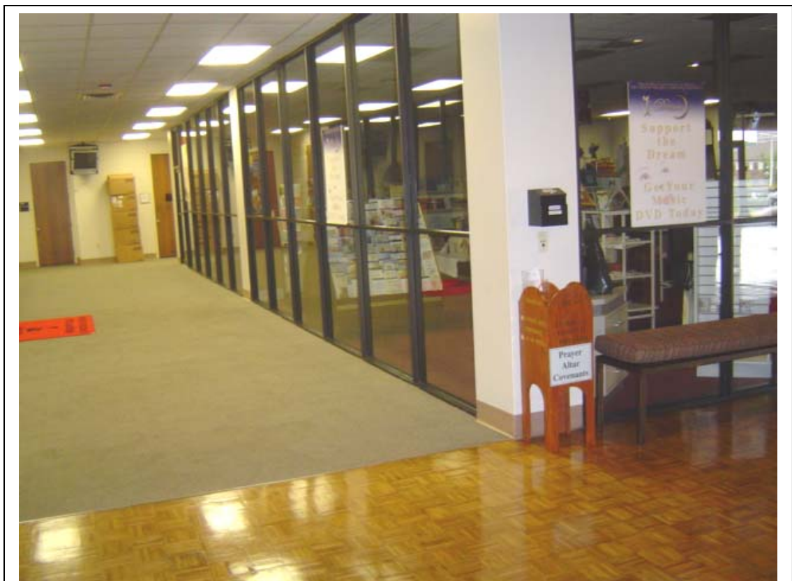
This photo shows a difference in flooring surfaces from carpet to wood tile. Potential slip and fall hazards exist due to the different flooring surfaces installed in a common pathway. Ideally, the surfaces should be consistent. Also note the high degree of smoothness to the hardwood flooring, which also could lead to a slip and fall.