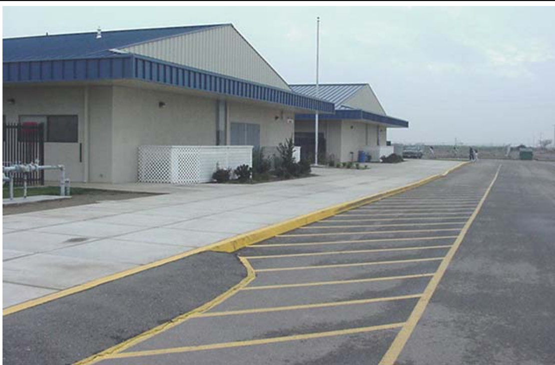
This photo illustrates good marking of the sidewalk and parking lot variances with yellow paint. By taking precautions such as these, the chances of slips and falls are greatly reduced.