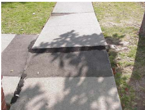
This photo illustrates severe trip hazards due to the uneven walking surface. Patching has been completed; however, it is not adequate. In this case, the entire section of the sidewalk should be replaced.