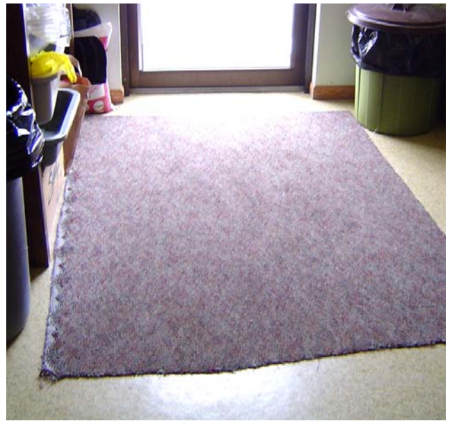
This photo shows a poor example of a floor mat. Carpet remnants should never be used in these areas. They are not designed to trap water and dirt, are not slip resistant and they will curl and fray on the edges.