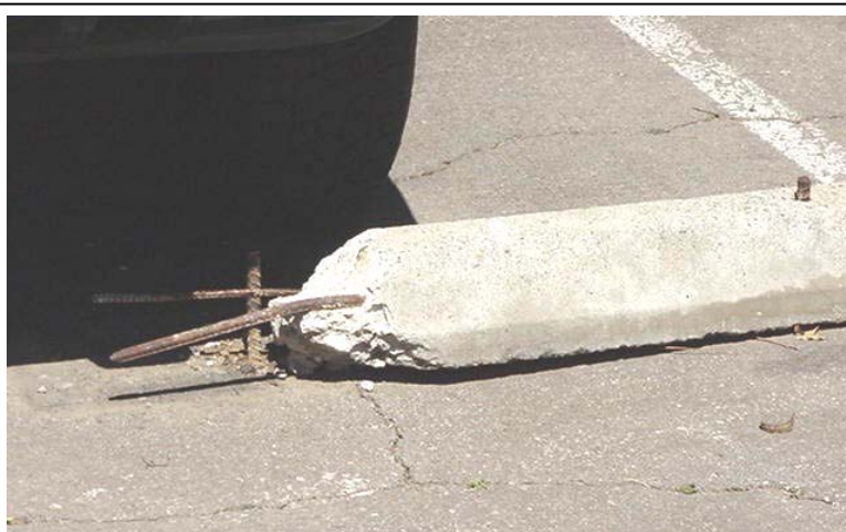
This photo illustrates a severe trip hazard due to the exposed rebar from the deteriorated tire stop. If a trip and fall would occur here, the potential for a severe injury is present from the sharp and exposed rebar rods. To correct the hazard, the entire tire stop should be replaced.