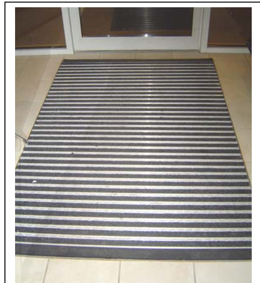
This photo shows an excellent control for minimizing the slip and fall potential in entryways. This is a grate system with a catch basin, which is built into the flooring surface. If this cannot be installed, use floor mats and/or runners.