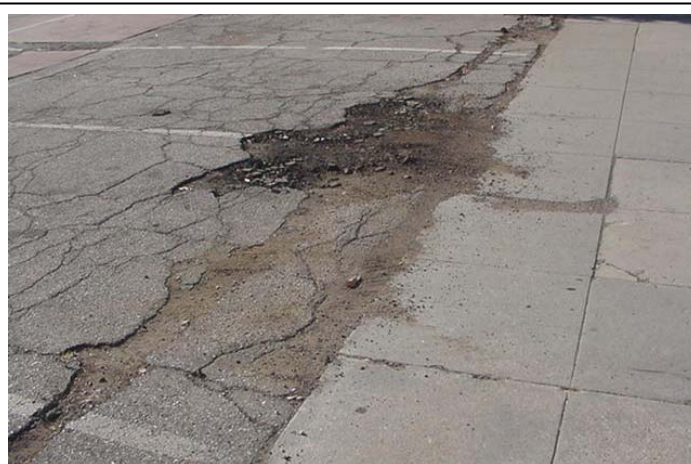
This photo illustrates a parking lot that has deteriorated creating trip and fall hazards due to the numerous cracks and depressions in the surface. To correct this hazard, the sections of asphalt should be resurfaced.